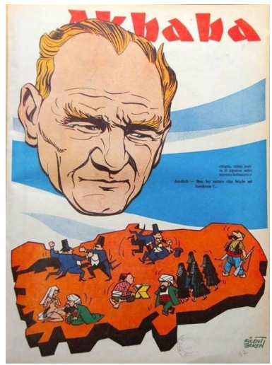
30 March 1966

The cover of the Akbaba political satire magazine, dated 30 August 1962, featured a powerful depiction of Atatürk asking, "Is this how I entrusted this homeland to you?"