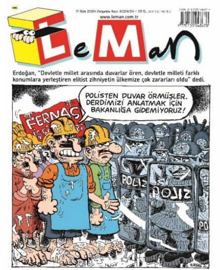
O sırada; aylardır çalışma koşullarını protesto eden Fernas Maden işçileri, Ankara'da kendileriyle görüşecek muhatap bulamayınca talepleri karşılanana kadar açlık grevi başlattıklarını duyurdu.

https://leman.com.tr/?srsltid=AfmBOoqP6_HlMW7gIqznpaAF1dWlGcj5z2H9iH4W3akGFj2mzbxdx8ic04.12.2024