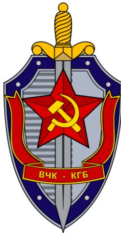
Image2. Emblem of the Cheka and KGB: Symbols of Soviet State Security

In KGB work, methods for watching people closely were made carefully to allow for constant checking of those seen as dangers to state safety. This system included many methods like getting into social groups, using people to inform on others, and using wiretapping tools, all of which created fear and forced obedience among citizens. These actions were backed by laws that allowed for large amounts of information to be gathered, often hiding the moral issues linked to this spying. As mentioned, strong new tools allow for the gathering, sharing, and studying of national safety information on a level never seen before (Seumas Miller et al., 2021), highlighting the importance of spying programs. The KGB logo, which stands for both power and control, was a strong sign of the state's watching eye, telling people that their privacy could be ignored for the sake of national safety.