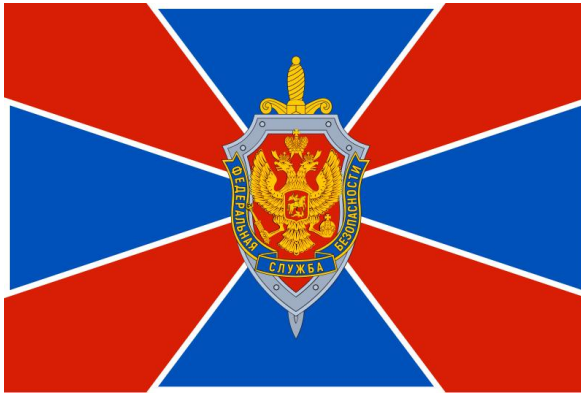
Image4. Flag of the Federal Security Service of the Russian Federation