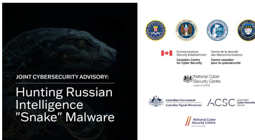
Image5. Joint Cybersecurity Advisory on Russian 'Snake' Malware